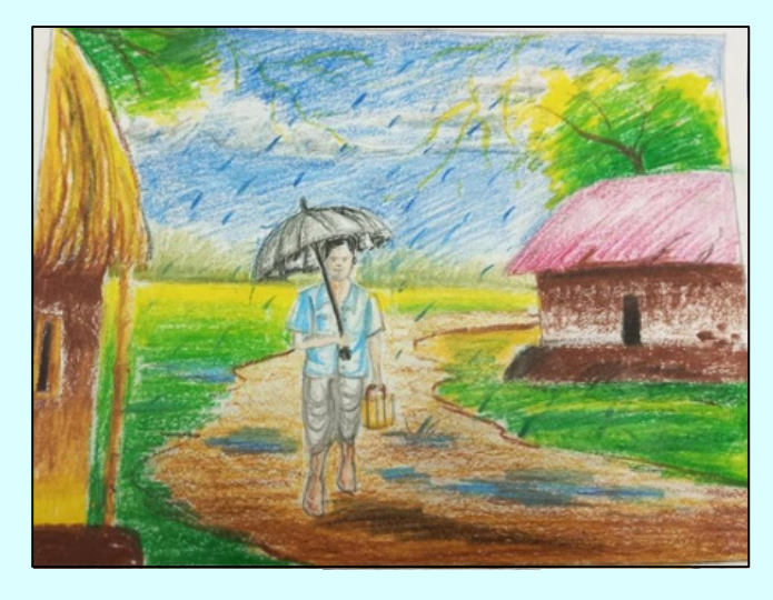
Art by: Shubham Dutta (VI)