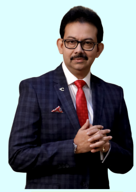
Table of Contents Page 1. Message from the

Page 1. Message from the Managing Director. Page 1. Value of the month - We the people Page 2. School Activities Page 3. Eco Initiatives & CSR Page 4. Students' Corner. Page 4. Coming Up